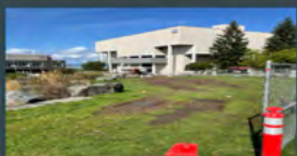
Increased construction nearby